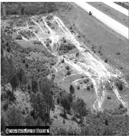
Illegal motorcycle routes Colorado Wild inventoried off of I-70 near Avon.

Currently, 91% of BLM land in Colorado is