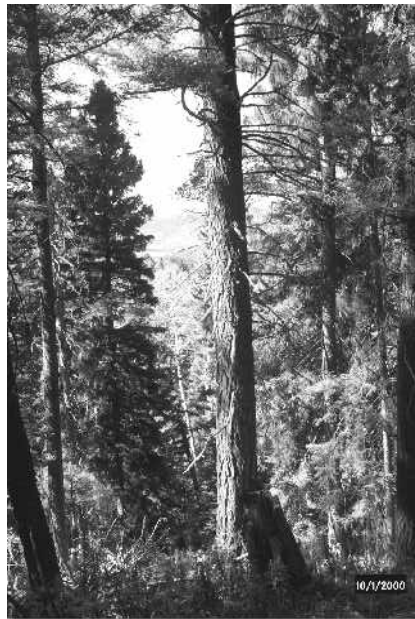
Old growth forest NW of Pagosa Springs protected by the roadless rule effectively rescinded by Pres. Bush.

I am certain you expect to hear of the Bush administration's environmental transgressions in this column. The new Forest Service Chief's call for increased logging of our National Forests; Bush's push for Congress to weaken the public involvement requirements of the National Environmental Policy Act (NEPA) and the consultation requirements of the Endangered Species Act (ESA) as it applies to timber sales; the Administration's refusal to adequately defend the roadless protection policy in court leaving roadless areas vulnerable to logging and other impacts for the time being. But I have a corollary tale to tell.